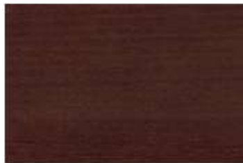
88 walnut brown