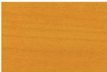
07 golden yellow