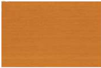
07 golden yellow