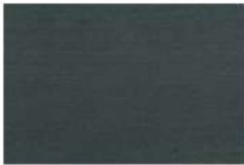
14 night blue