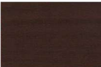
87 antique walnut