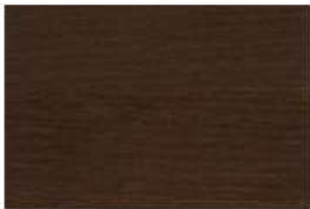
87 antique walnut