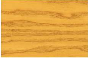
07 golden yellow