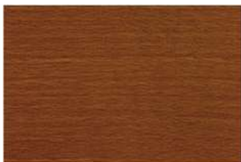
93 pale walnut