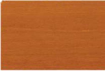
07 golden yellow