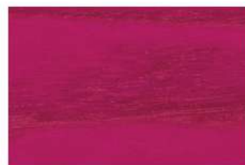
26 bright red

Below, some examples of colours obtained by mixing the basic dyes