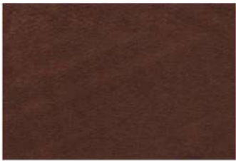
94 medium walnut