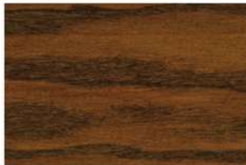
95 dark walnut