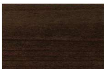
95 dark walnut