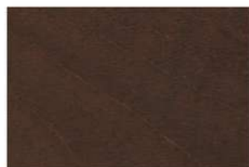
94 medium walnut