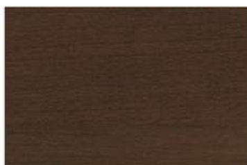
93 pale walnut