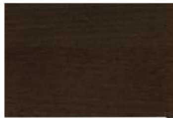
84 Brenner walnut