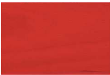
25 flame red