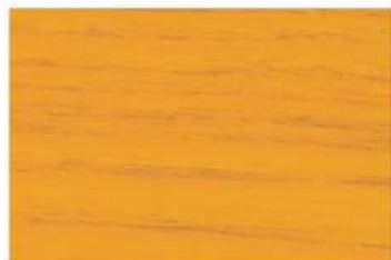
0/ golden yellow