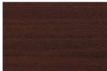
93 light walnut