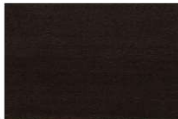
84 Brenner walnut