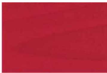
26 bright red