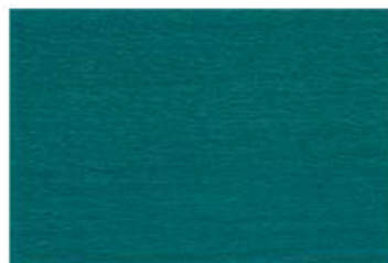
14 dark blue