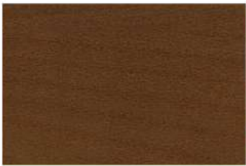
87 antique walnut