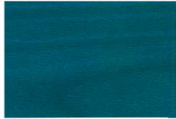
14 dark blue