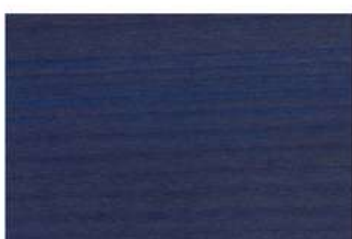
56 Elba blue