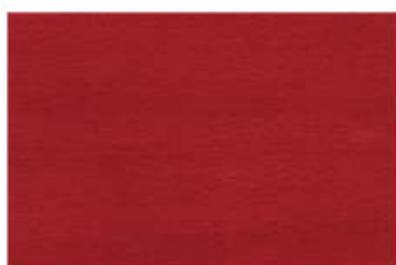
25 light red