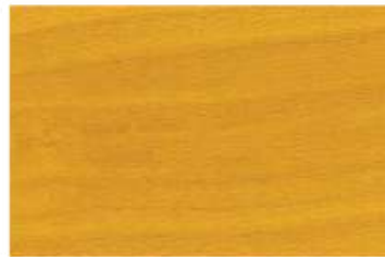
17 pale yellow