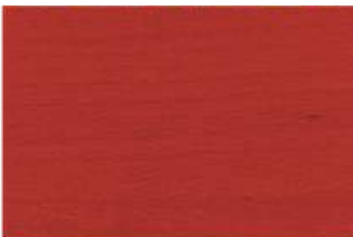
39 Indian red